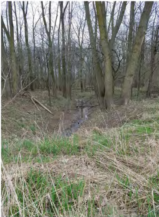
Where Tributary starts run through mature woods