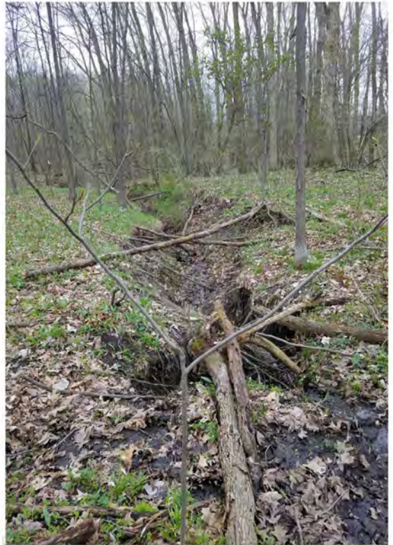
Where upper Tributary (ditch) enters mature woods