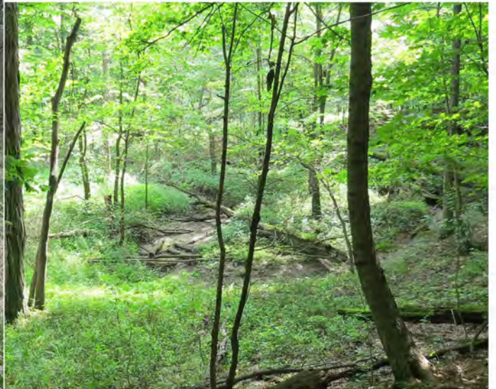
Meandering section of Tributary in mature woods