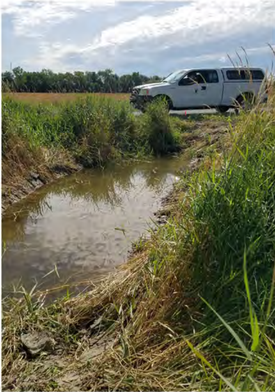
Upstream end of Tributary, at Road 197