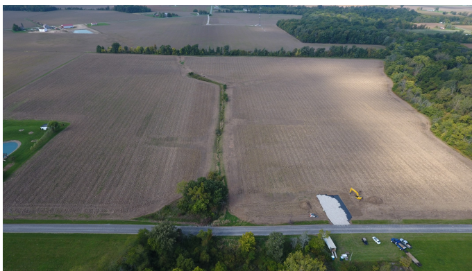
Aerial view of the restoration area pre and post construction

With the help of the Antwerp Conservation Club, we held several stewardship days over the winter to clear out woody invasive species ahead of the tree planting.